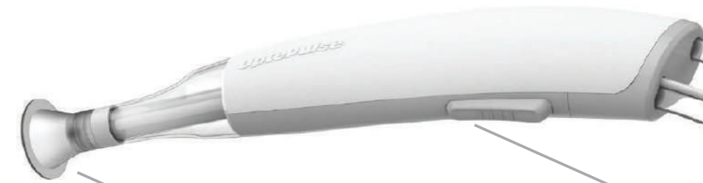
Knee & Acetabular nozzle with integrated mesh shape splash shield