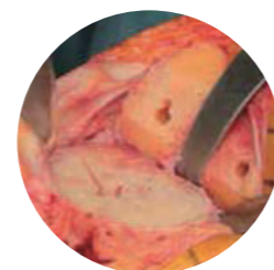
Images show before and after use of high pressure pulse lavage.